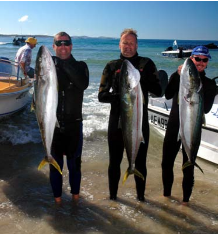
The 3 Kings.....well maybe not!