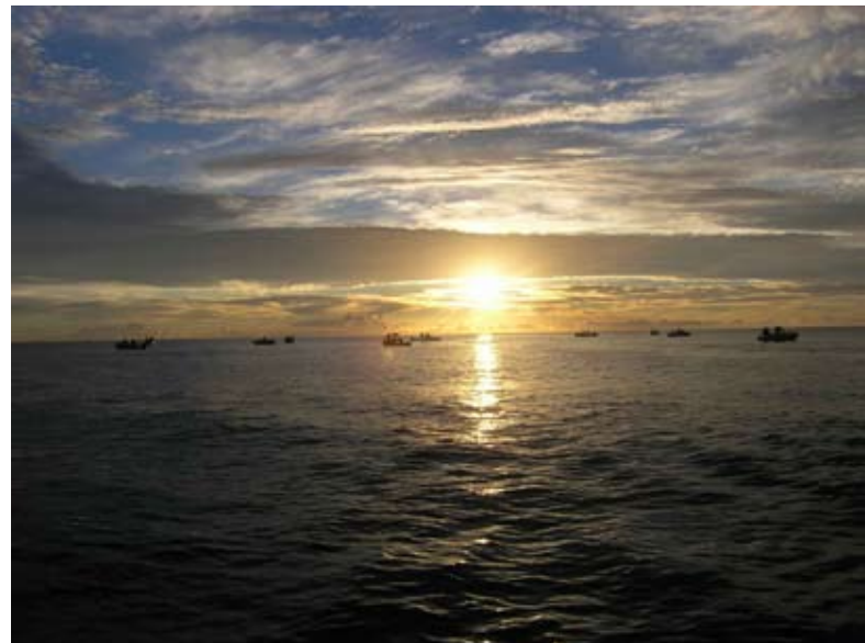
A magnificent Day 1 morning

It really was a case of second time lucky after the first attempt to hold the event for 2006 resulted in a postponement due to the effects of a tropical cyclone that tracked down the coast from far north Queensland in late March. However this time around there was to be no such problem with the weather.