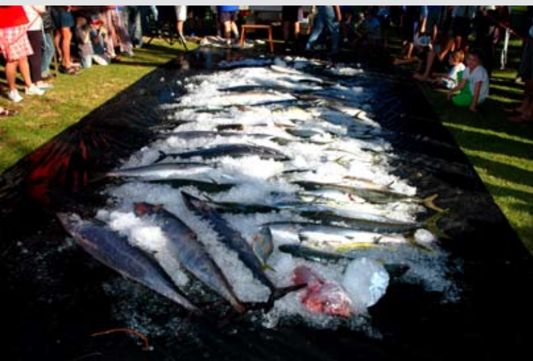
The Hotly contested "Fish Auction"

The fish auctions conducted on Saturday and Sunday afternoons held by Rotary at the Woolgoolga Beach Reserve attracted large crowds both days, and some bargains were to be had, with fish up to 20kg selling for as little as $35.